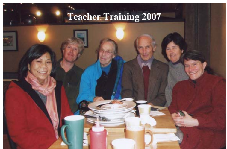
Teacher Training 2007