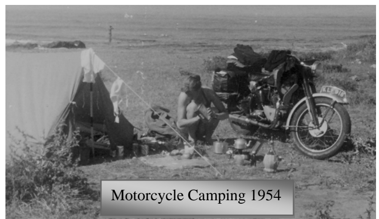
Motorcycle Camping 1954