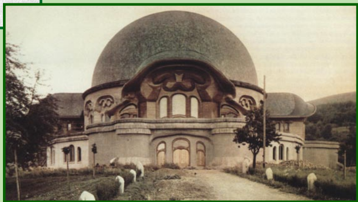
The first Goetheanum